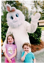
So much fun!

Join us for our annual Easter egg hunt, Easter Bunny, Tiff's Treats Truck & more! Treat filled eggs & volunteers needed! Sign up here: bit.ly/egg-2024