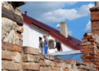
Preparing Shelters for Ukrainians in Czeck Republic

Environmental Sustainability: Responding to the United Methodist call for global action on the climate crisis, this ministry fosters the integration of environmental sustainability into every aspect of mission: elimination of green-house gasses, implementing renewable energy projects, energy efficiency strategies, and waste reduction. (Advance #3021591)