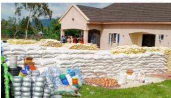
Food aid in Nigeria

UMCOR-Where Most Needed: From the 1940's, UMCOR has provided humanitarian relief and disaster response in the United States and internationally. It utilizes integrated solutions to address root causes of disruption. The "Most Needed" fund targets places where natural disaster or conflicts have resulted in such damage that communities are unlikely to recover on their own. It brings relief after disruption by hurricanes, tornadoes, and wildfires; or during and after wars like those between Ukraine and Russia and between Israel and Hamas. UMCOR also helps communities reduce the risk of natural disasters and prepare for emergencies, by addressing issues as health, sanitation, poverty, sustainable agriculture, nutrition, and food security. (Advance #999895)