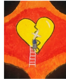
Healing my Heart Anonymous

GEORGIA APPLESEED Center for Law & Justice